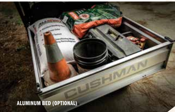
ALUMINUM BED (OPTIONAL)